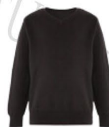
Plain Black V Neck Sweater (Optional)