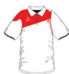
Boys Indoor PE Top*