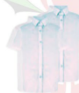
White Shirt Long/short sleeve