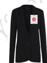
School Blazer* All Year Groups 7-11