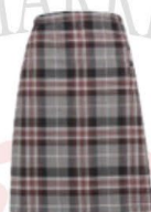
Skirt: Plaid style for Yr7&8, no black skirts